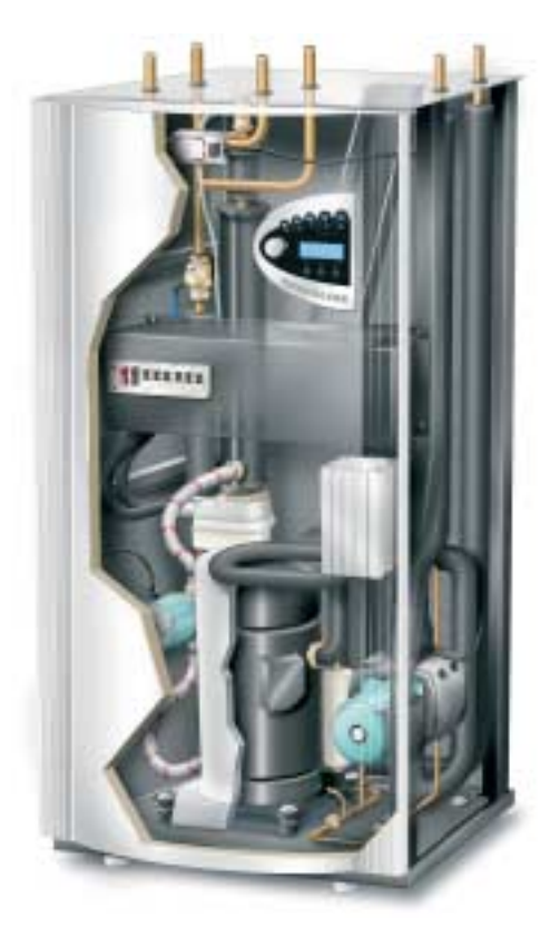
IVT's heat pumps come complete with everything built in from the factory, which means quick and easy installation.